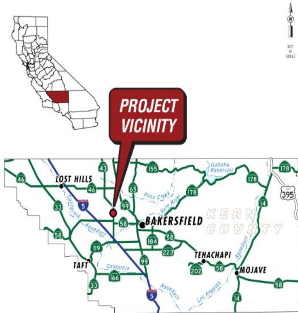
Figure 1-1 Project Vicinity Map