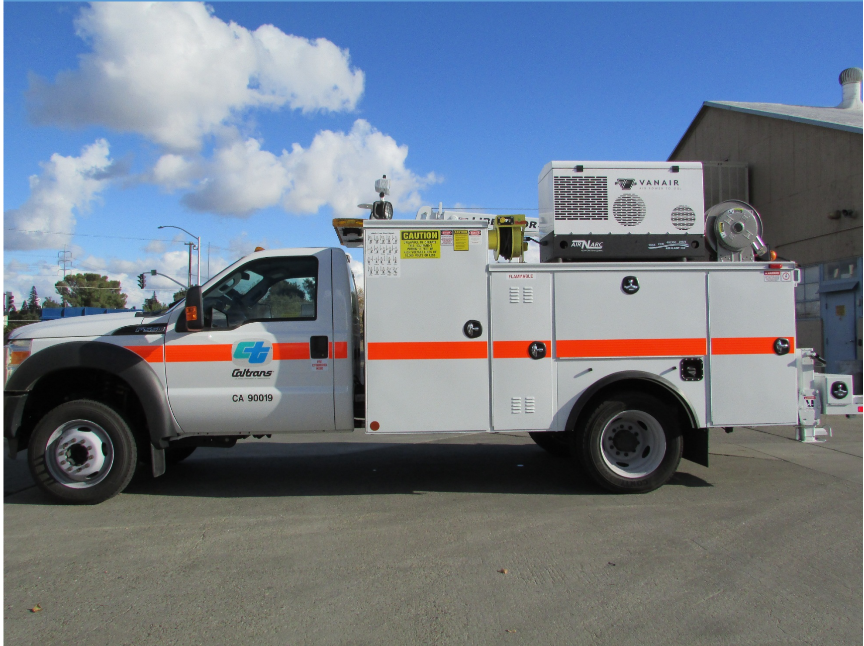
MAINTENANCE CLASS 01436 MECHANIC BODY, 1-TON, SUPER DUTY, GAS