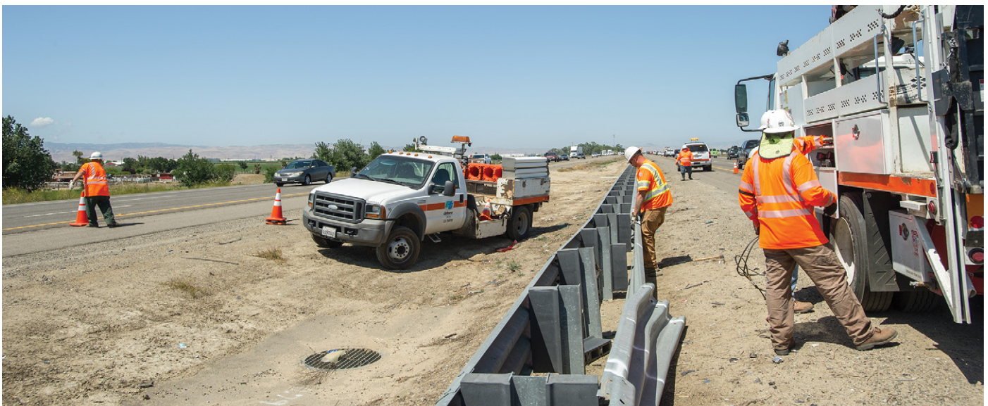
Caltrans maintenance crews keep the equipment humming as they repair pavement and guardrails along State Route 113 near Davis in Yolo County.