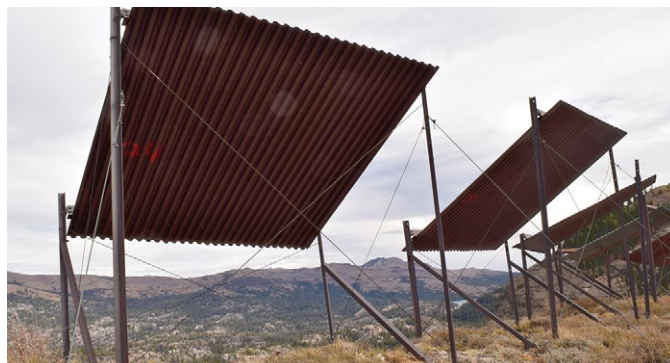
Metal panels called “jet roofs” line a section of a Central Sierra ridge above Highway 88 to keep potentially deadly cornices from forming.

Caltrans maintains 142 of these structures along the ridge lines above Highway 88, in an avalanche-prone area known as the Carson Spur. Caltrans also maintains 65 wind fence installations, each 8 feet by 10 feet, on the windward side of lower passes near the Kirkwood Ski Resort. The total length of the system protects .63 miles of exposed ridge line from cornice buildup.