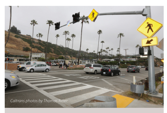
In 2017, Caltrans completed a pedestrian-activated crosswalk beacon on a particularly busy stretch of State Route 1 in Los Angeles.

Nearly 4,900 traffic safety investigations were conducted in calendar year 2017 by Caltrans' Division of Traffic Operations, which initiated the pilot pedestrian/bicyclist collision