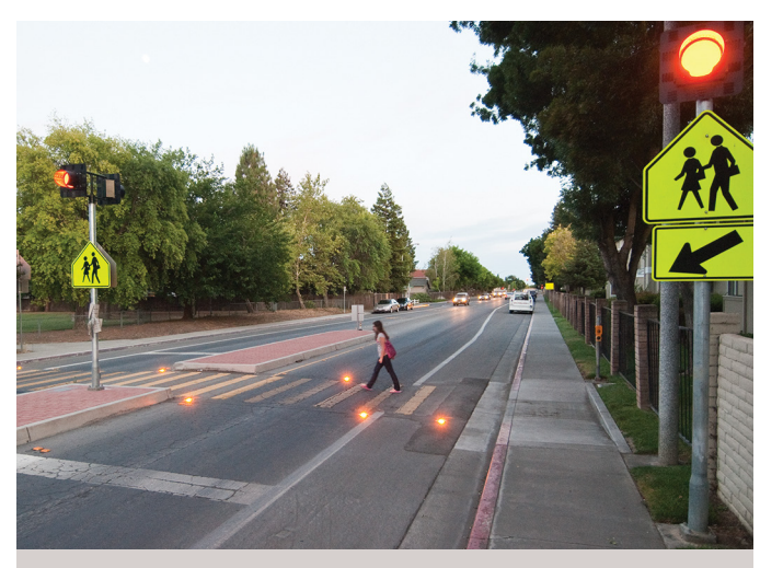
At a school zone in Woodland, north of Sacramento, lights mounted overhead and built into the pavement flash when activated.

One investigation at a South Lake Tahoe location yielded a successful funding request to improve a section of U.S. 50 between the junction with State Route 89 and Stateline — the result of work between safety staff from regional District 3, the Tahoe Regional Planning Agency and the Tahoe Transportation