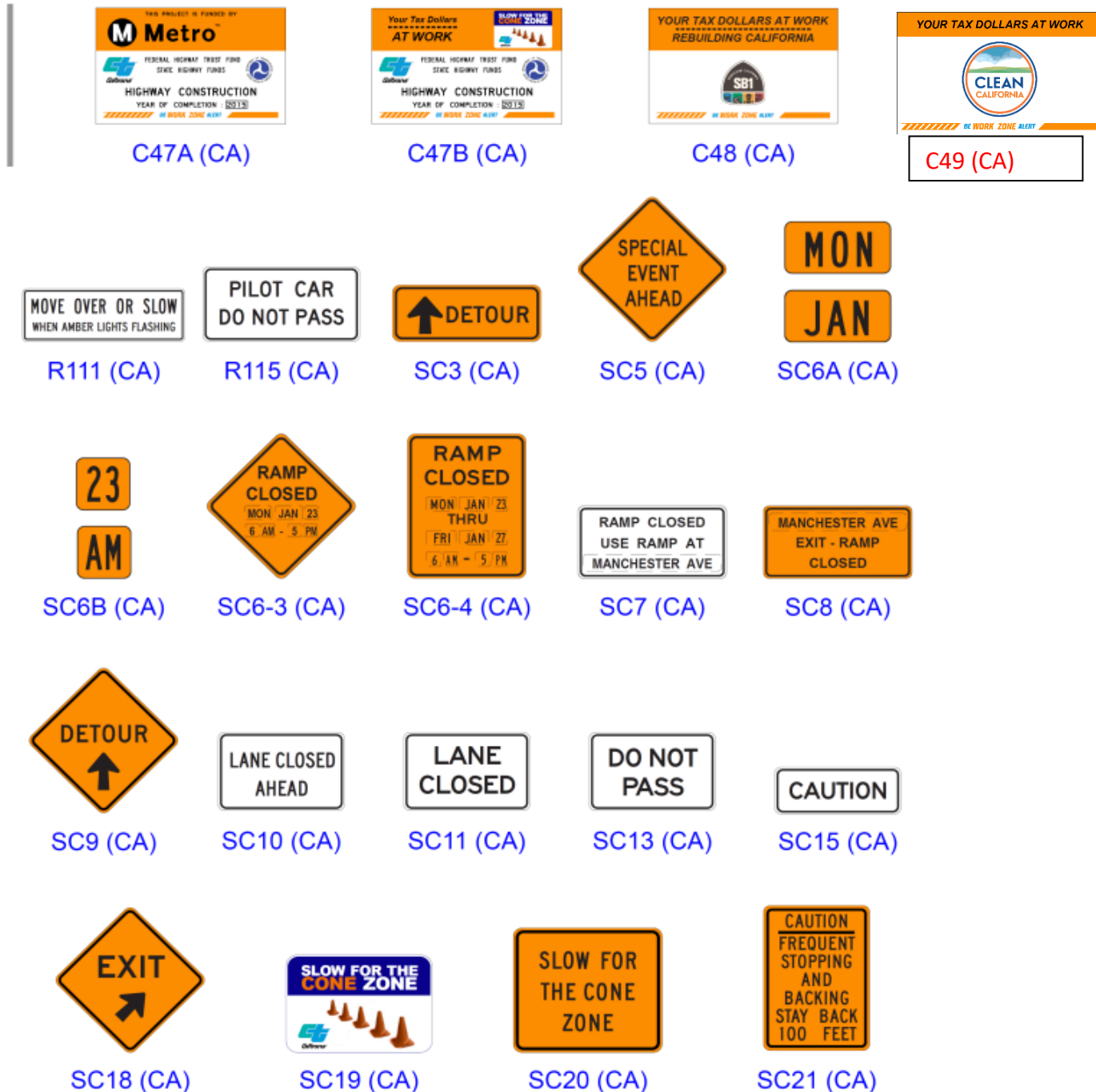
Figure 6F-101 (CA). California Temporary Traffic Control Signs (Sheet 2 of 2)