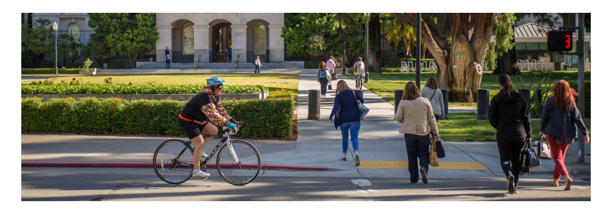
Photo 1: Pedestrians and a cyclist at a crosswalk near the California State Capitol.