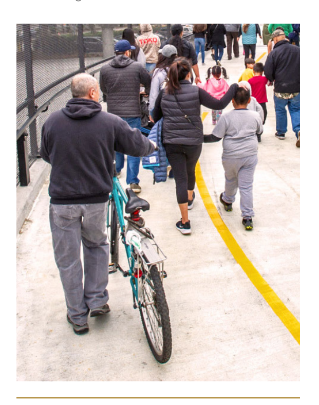
Photo 3: Pedestrians and cyclists crossing the Clarke Avenue Highway 101 overcrossing for the first time in 2019.