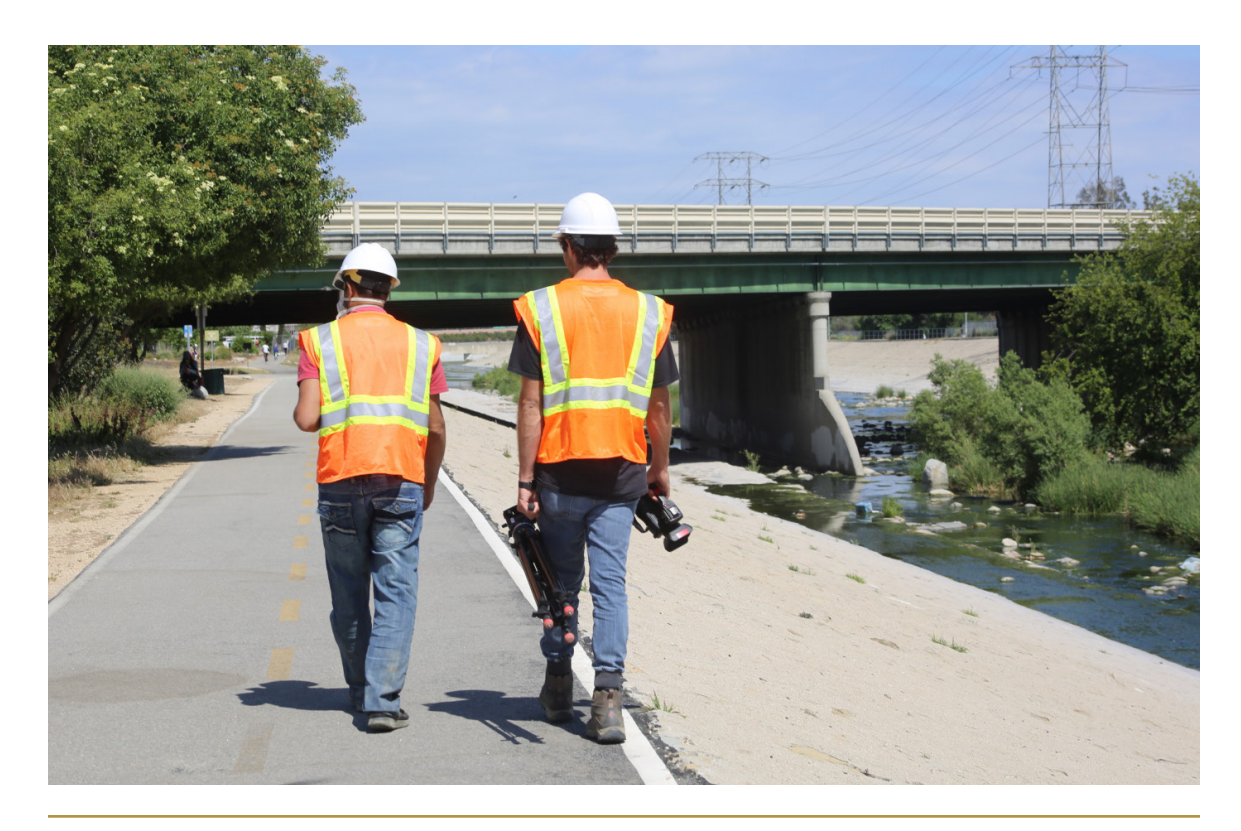
Photo 16: Two Caltrans workers walking on a bike path in Burbank, California.