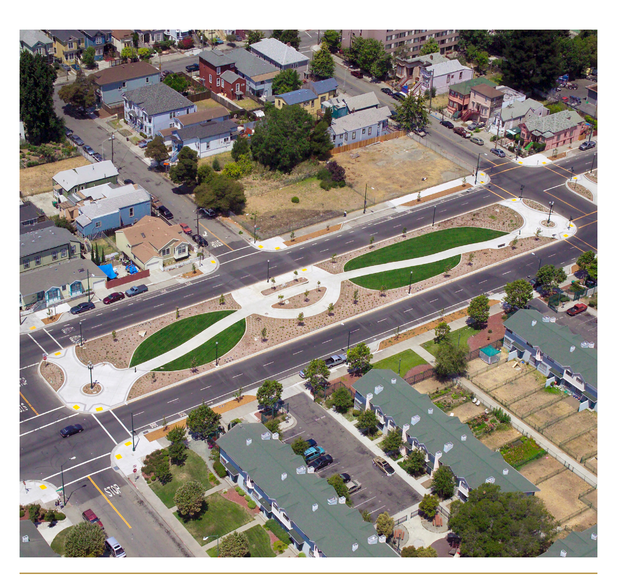
Photo 22: The new Mandela Parkway in Oakland, California, following conversion from the Cypress Street Viaduct.

Caltrans District 9 is developing a consolidated funding opportunities list which will provide a foundation for a strategic, system wide approach toward funding active transportation and related transit/first-last mile projects. Both internal and external stakeholder will be able to see the full suite of available funding opportunities such that project level funding strategies can be developed.