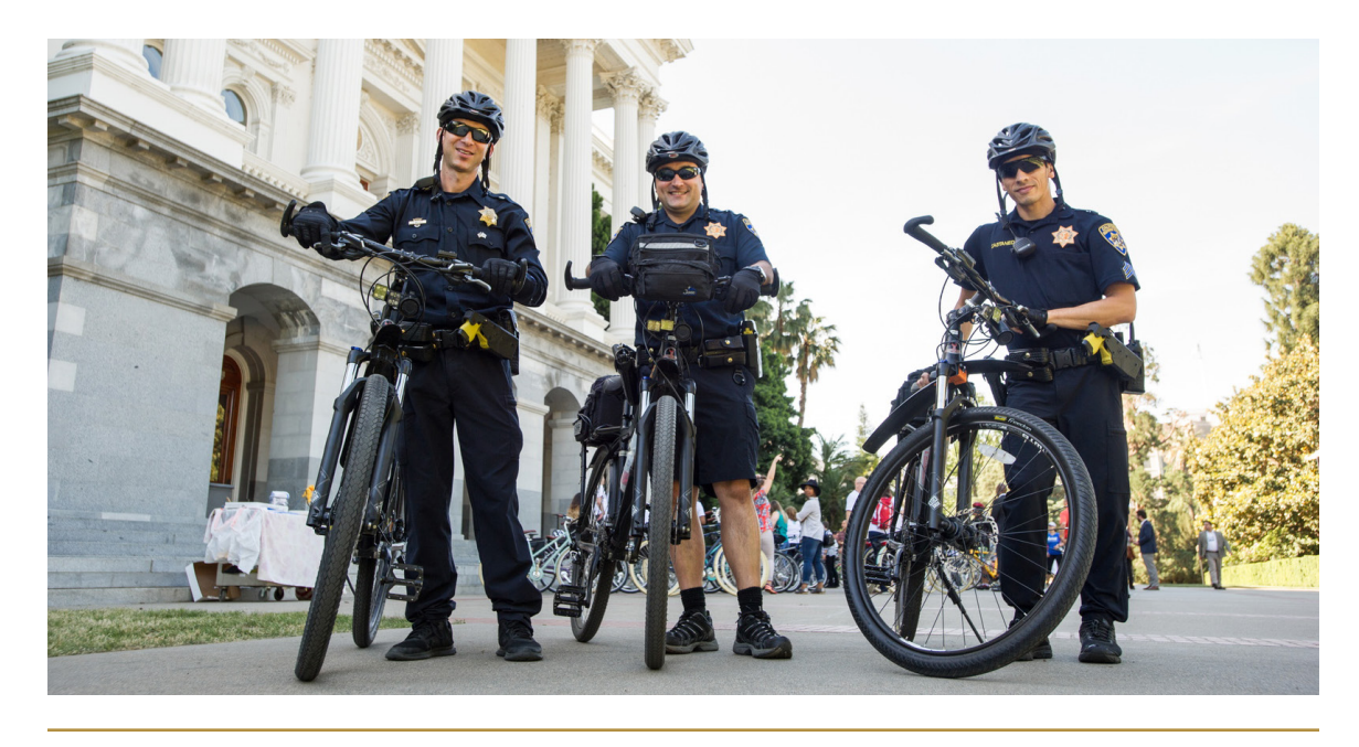
Photo 6: Three Capitol Protection Section (CPS) officers posing with their bikes.

In total, CHP efforts reached 1,278,902 people through traffic safety presentations, events, and public outreach.