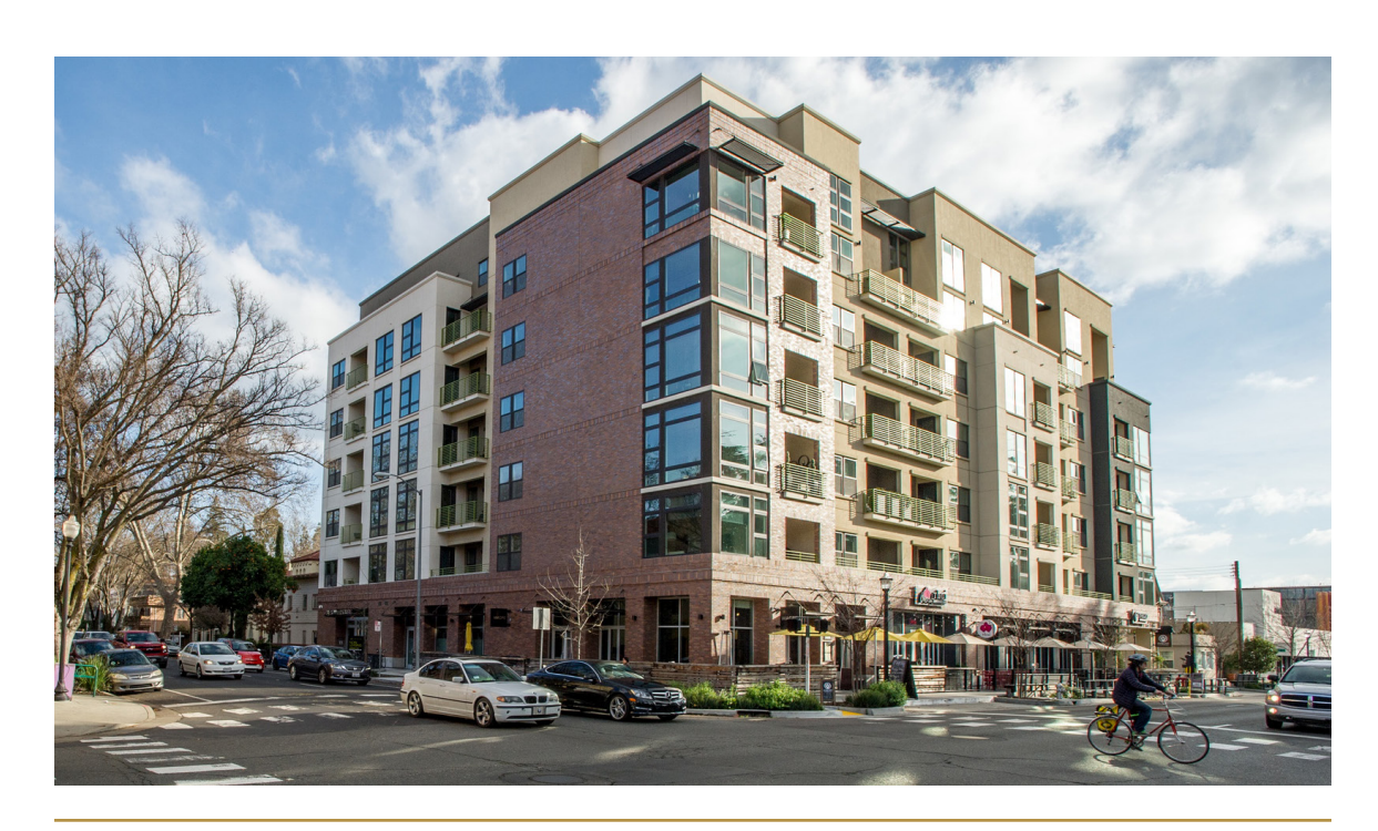
Photo 14: Urban living housing downtown Sacramento with cars and bicycles outside.