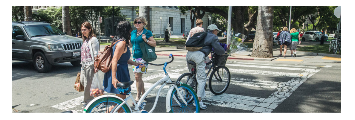
Photo 7: Bikes and pedestrians in a crosswalk near the California Capitol.