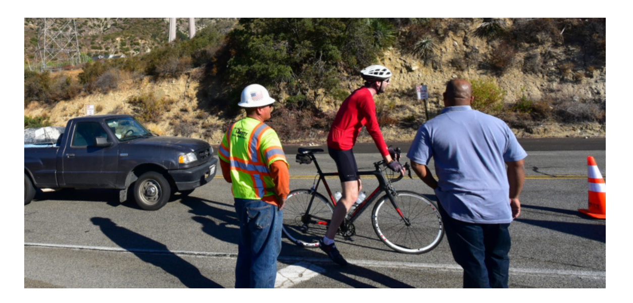
Photo 8: A few Caltrans workers run a bike consideration test on State Route 2.