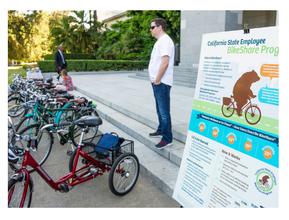
Photo 18: California State Employee BikeShare Program launch at the Capitol.