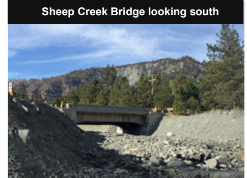
Sheep Creek Bridge looking south