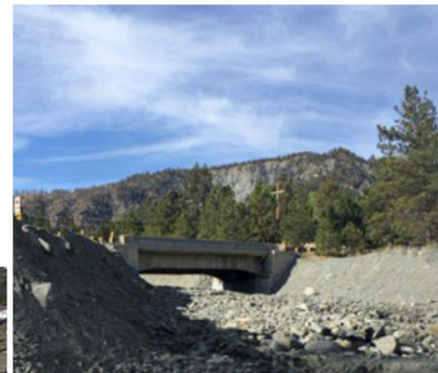
Sheep Creek Bridge looking east/ Above photo looking south