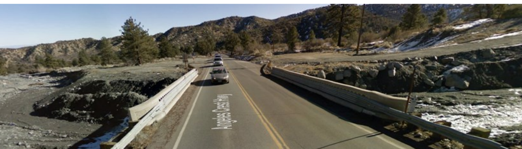
Sheep Creek Bridge looking east/ Above profile looking west