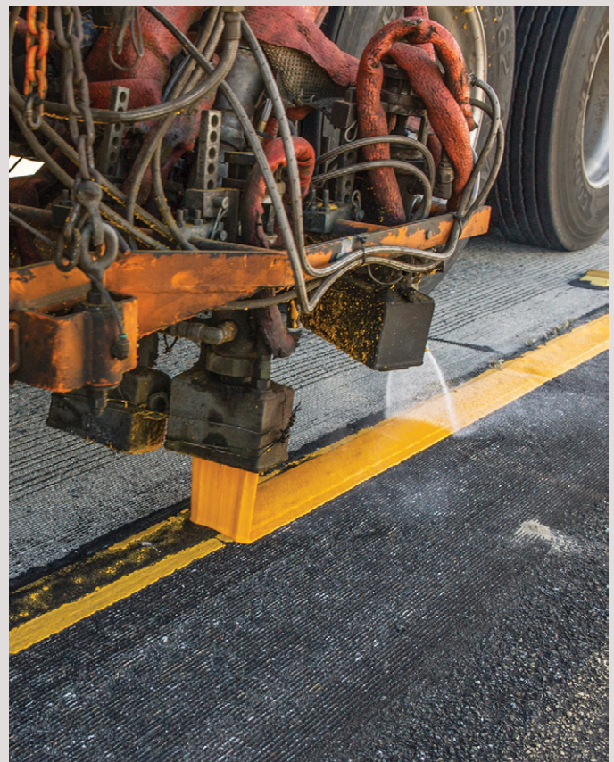
A new layer of thermal plastic is laid down as part of a restriping project. Tiny glass beads are then sprayed on to increase reflectivity.