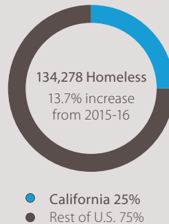
Homeless Population 2016-17